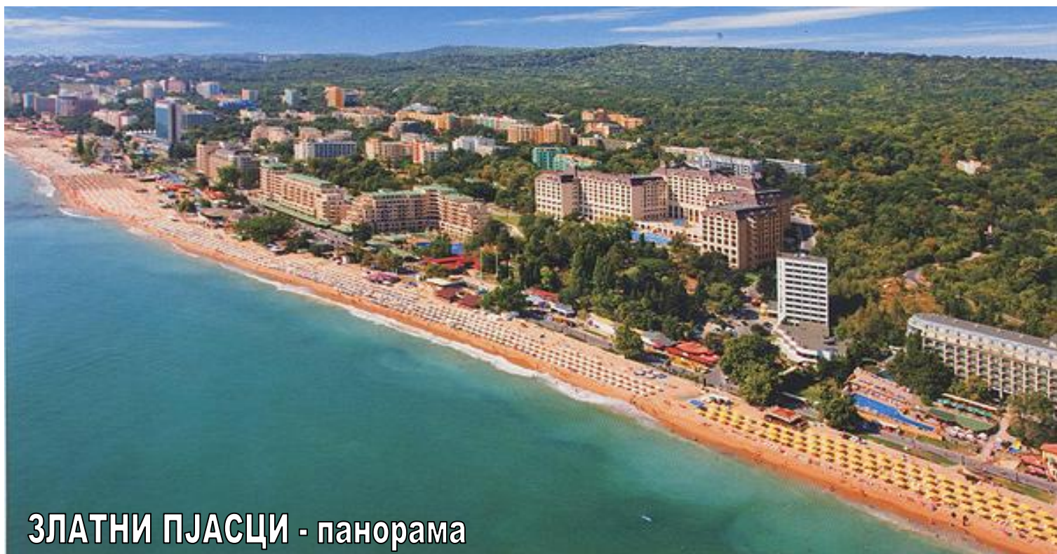
ЗЛАТНИ ПЈАСЦИ - панорама